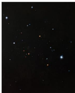
Artist: Jason Werner Title: StarField 4 Date: 2017 Size: 48" x 60" medium: acrylic on canvas Price $3800