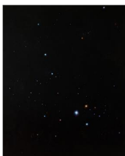
Artist: Jason Werner Title: StarField 5 Date: 2017 Size: 48" x 60" medium: acrylic on canvas Price $3800