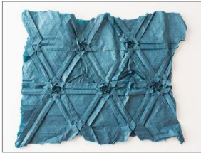
Artist: Ben Parker Title: Broken Barriers Date: 2016 Size: 20 1/2" x 16" medium: folder single sheet, handmade o-gami Price $750