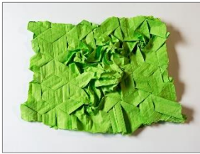
Artist: Ben Parker Title: Writhe Date: 2016 Size: 17 1/2" x 12 1/2" medium: folder single sheet, handmade o-gami Price $750