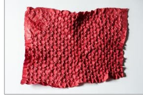
Artist: Ben Parker Title: Undulation Date: 2016 Size: 20 1/2" x 16" medium: folder single sheet, handmade o-gami Price $750