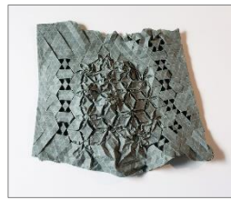
Artist: Ben Parker Title: Breached Containment Date: 2016 Size: 20 1/2" x 16" medium: folder single sheet, handmade o-gami Price $750