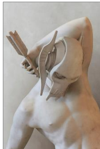
Artist: Travis Durden Title: General Noibides medium: archival ink on canson arches museum $375 unframed 15 3/4 x 23 1/2 (image) $575 framed (24 x 32)