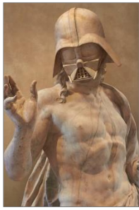
Artist: Travis Durden Title: Darth Resurrection medium: archival ink on canson arches museum $375 unframed 15 3/4 x 23 1/2 (image) $575 framed (24 x 32)