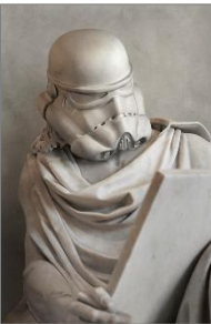
Artist: Travis Durden Title: Storm Reader medium: archival ink on canson arches museum $375 unframed 15 3/4 x 23 1/2 (image) $575 framed (24 x 32)