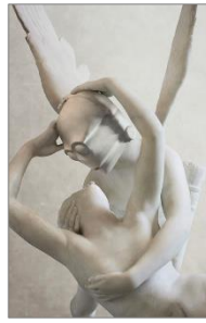
Artist: Travis Durden Title: Love Droid medium: archival ink on canson arches museum $375 unframed 15 3/4 x 23 1/2 (image) $575 framed (24 x 32)