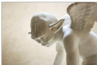
Artist: Travis Durden Title: Angel Yodea medium: archival ink on canson arches museum $375 unframed 15 3/4 x 23 1/2 (image) $575 framed (24 x 32)