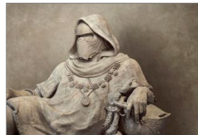
Artist: Travis Durden Title: Admiral de Ren medium: archival ink on canson arches museum $375 unframed 15 3/4 x 23 1/2 (image) $575 framed (24 x 32)