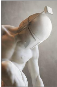
Artist: Travis Durden Title: Boba medium: archival ink on canson arches museum $375 unframed 15 3/4 x 23 1/2 (image) $575 framed (24 x 32)