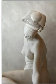
Artist: Travis Durden Title: The Nymph Bounty Hunter medium: archival ink on canson arches museum $375 unframed 15 3/4 x 23 1/2 (image) $575 framed (24 x 32)