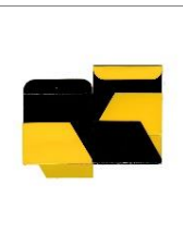
Artist: Linda Lindroth Title: Blinky Date: 2012 Size: 24" x 37" medium: Archival Pigment Print on Epson Hot Press Natural Price $1500 unframed