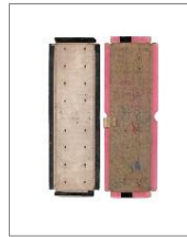
Artist: Linda Lindroth Title: Automatic Drawing Date: 2011 Size: 24" x 37" medium: Archival Pigment Print on Epson Hot Press Natural Price $1500 unframed