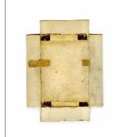
Artist: Linda Lindroth Title: Sylvia Date: 2012 Size: 24" x 37" medium: Archival Pigment Print on Epson Hot Press Natural Price $1500 unframed