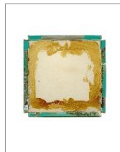
Artist: Linda Lindroth Title: Howard 2 Date: 2011 Size: 32" x 37" medium: Archival Pigment Print on Epson Hot Press Natural Price $3750 framed