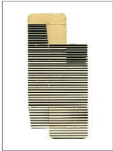
Artist: Linda Lindroth Title: Loos Date: 2012 Size: 24" x 37" medium: Archival Pigment Print on Epson Hot Press Natural Price $1500 unframed