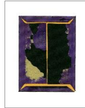
Artist: Linda Lindroth Title: Yellow I-Beam Date: 2015 Size: 24" x 37" medium: Archival Pigment Print on Epson Hot Press Natural Price $1500 unframed