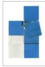
Artist: Linda Lindroth Title: Dresden Date: 2012 Size: 24" x 37" medium: Archival Pigment Print on Epson Hot Press Natural Price $1500 unframed