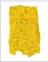
Artist: Linda Lindroth Title: Crepe Yellow Date: 2015 Size: 24" x 37" medium: Archival Pigment Print on Epson Hot Press Natural Price $1500 unframed