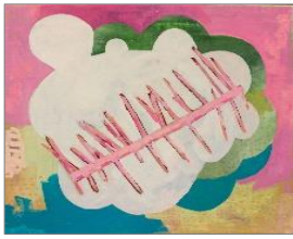
Artist: Sharon Butler Title: Back Fat Date: 2015 Size: 16" x20" medium: oil on canvas Price $1800