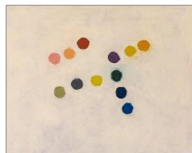
Artist: Sharon Butler Title: Dots Date: 2015 Size: 16" x20" medium: oil on canvas Price $1800