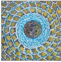
Artist: Tadashi Moriyama Title: Engulfing Whirlpool Date: 2015 Size: 18" x18" medium: acrylic and ink on paper Price $3000