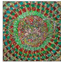
Artist: Tadashi Moriyama Title: Meet Me At My Virtual Forest Date: 2015 Size: 18" x18" medium: acrylic and ink on paper Price $3000