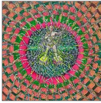
Artist: Tadashi Moriyama Title: Colossus Dominating Networks Date: 2015 Size: 18" x18" medium: acrylic and ink on paper Price $3000