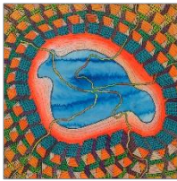
Artist: Tadashi Moriyama Title: Fusion Cell Date: 2015 Size: 18" x18" medium: acrylic and ink on paper Price $3000