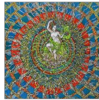
Artist: Tadashi Moriyama Title: Venus With A Mirror Date: 2015 Size: 18" x18" medium: acrylic and ink on paper Price $3000