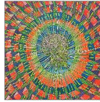
Artist: Tadashi Moriyama Title: Oblivion Date: 2015 Size: 18" x18" medium: acrylic and ink on paper Price $3000