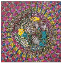
Artist: Tadashi Moriyama Title: iphone Abyss Date: 2015 Size: 18" x18" medium: acrylic and ink on paper Price $3000