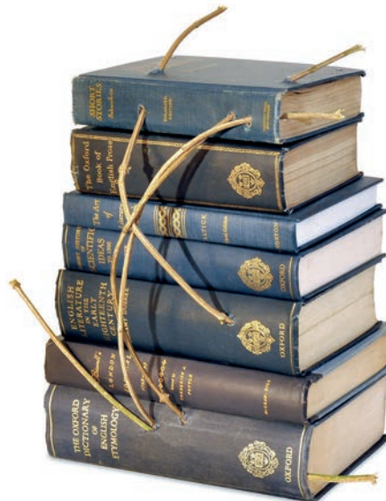
"File Under Anglo" by Dan Levin