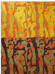
Artist: Mark Williams Title: Double Cub Run Date: 2015 Size: 40" x 30" medium: screen print on printed fabric Price $1000