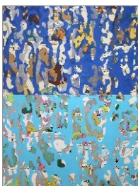
Artist: Mark Williams Title: Double Blue Marengo Date: 2015 Size: 40" x 30" medium: acrylic and screen print on printed fabric Price $1500