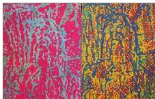
Artist: Mark Williams Title: Pink Blue Woodward Date: 2014 Size: 20" x 32" medium: acrylic and screen print on printed fabric Price $1200