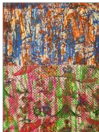
Artist: MarkWilliams Title: Orange Green Bluff River Date: 2015 Size: 40" x 30" medium: acrylic and screen print on printed fabric Price $1500