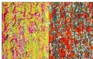
Artist: Mark Williams Title: Yellow Orange Luray Date: 2014 Size: 20" x32" medium: acrylic and screen print on printed fabric Price $1000