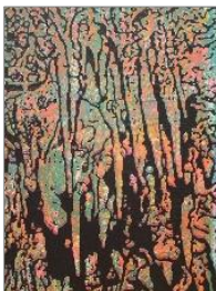
Artist: Mark Williams Title: Cedar Ridge Crystal Black Date: 2014 Size: 40" x 30" medium: acrylic and screen print on printed fabric Price $1500