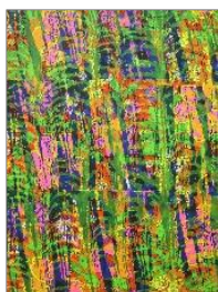
Artist: Mark Williams Title: Fluorescent Yellow Howe Date: 2014 Size: 40" x 30" medium: acrylic and screen print on printed fabric Price $1200