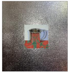
Artist: Terry Donsen Feder Title: Birds Date: 2009 Size: 18" x 18" Medium: oil on aluminum Price $1500