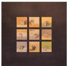
Artist: Terry Donsen Feder Title: Counter Parts Date: 2009 Size: 30" x 30" Medium: oil on aluminum Price $1800