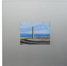
Artist: Terry Donsen Feder Title: Reach Date: 2014 Size: 22" x 22" Medium: oil on aluminum Price $1500