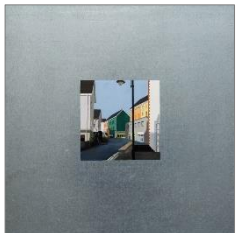
Artist: Terry Donsen Feder Title: Clifden Date: 2014 Size: 24" x 24" Medium: oil on aluminum Price $1500