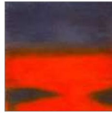
Artist: Suzan Scott Title: Sunrise 2.4 Size: 12 x 12 Medium: oil on canvas Price $475