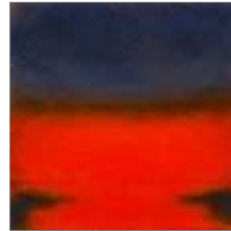
Artist: Suzan Scott Title: Sunrise 2.5 Size: 12 x 12 Medium: oil on canvas Price $475