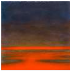
Artist: Suzan Scott Title: Early Hours #2 Size: 12 x 12 Medium: oil on canvas Price $475