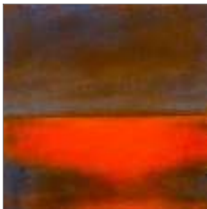
Artist: Suzan Scott Title: Sunrise 2.2 Size: 12 x 12 Medium: oil on canvas Price $475