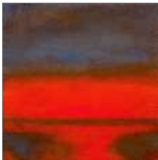
Artist: Suzan Scott Title: Sunrise 2.3 Size: 12 x 12 Medium: oil on canvas Price $475