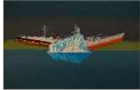
Artist: Robert Morris Title: Transition Size: 12 x 8 Medium: acrylic on panel Price Framed $ 1000