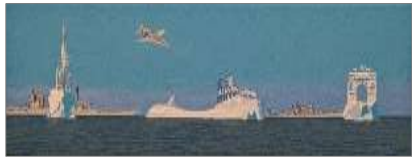
Artist: Robert Morris Title: Surgical Strike Size: 16 x 6 Medium: acrylic on panel Price Framed $ 950