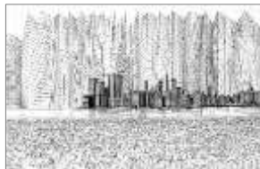
Artist: Robert Morris Title: Brooklyn Size: 17 x 11 Medium: acrylic on panel Price Framed $950