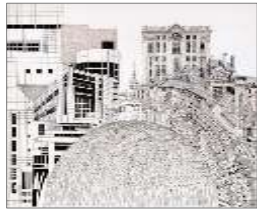
Artist: Robert Morris Title: Mont san Michel Condos Size: 17 x 14 Medium: acrylic on panel Price Framed $1000