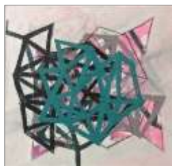
Artist: Matthew Best Title: "Moose Disco II" Size: 24" x 24" Medium: acrylic on panel Price $700