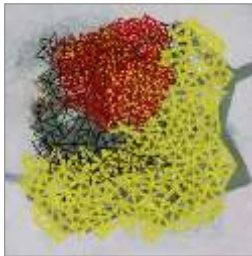
Artist: Matthew Best Title: untitled Size: 16" x 16" Medium: acrylic on panel Price $450