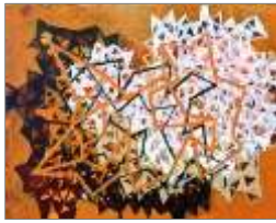
Artist: Matthew Best Title: 'Burt Reynolds' Size: 30" x 24" Medium: acrylic on panel Price $850