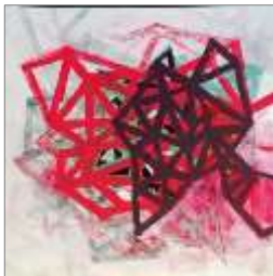
Artist: Matthew Best Title: "Moose Disco" Size: 24" x 24" Medium: acrylic on panel Price $700