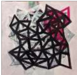
Artist: Matthew Best Title: "Curio" Size: 24" x 24" Medium: acrylic on panel Price $700