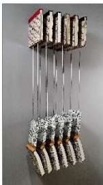
Artist: Chris Perry Title: 161 Ripples: downpour Date: 2016 Size: 49" x 16" x 12" medium: altered books, paper, fabric, gel acetate, aluminum Price $2200