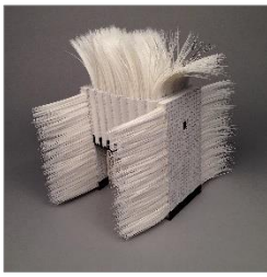
Artist: Chris Perry Title: 148 Ripples: reef Date: 2014 Size: 17" x 15" x 18" medium: paper, fabric, gel acetate Price $2200