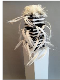
Artist: Chris Perry Title: 135 Ripples: water column Date: 2013 Size: 24" x 18" x 18" medium: paper, fabric Price $2100