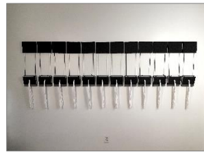
Artist: Chris Perry Title: 176 Ripples: levee (not enough fingers) Date: 2017 Size: 40" x 98" x 4" medium: altered books, paper, fabric Price $2200