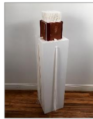
Artist: Chris Perry Title: 178 Ripples: ame Date: 2013 Size: 48" x 12" x 12" medium: altered books, paper, fabric Price $2000