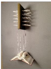
Artist: Chris Perry Title: 164 Ripples: dew point Date: 2016 Size: 38" x 18" x 12" medium: altered books, paper, fabric, aluminum Price $2200