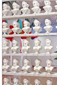
Artist: Stass Shpanin Title: Souvenirs Date: 2016 Size: 8 x 6 x 6 in. (each.) Medium: Mixed Media Price $30 each (add $10 to Ship within US)