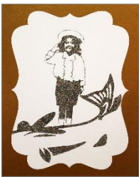
Artist: Stass Shpanin Title: Poster Series - The Catch Date: 2017 Size: 29" x 23" Medium: Flashe and Glitter on Canvas Price $1600