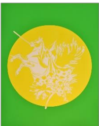
Artist: Stass Shpanin Title: Poster Series - Sun On Grass Date: 2017 Size: 29" x 23" Medium: Flashe on Canvas Price $1600