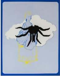
Artist: Stass Shpanin Title: Poster Series - Two Beauties Date: 2017 Size: 29" x 23" Medium: Flashe and glitter on Canvas Price $1600