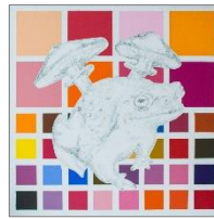
Artist: Stass Shpanin Title: Poster Series - Make Up Date: 2017 Size: 24" x 24" Medium: Flashe and glitter on Canvas Price $1000