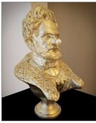
Artist: Stass Shpanin Title: Golden Colt Date: 2016 Size: 8 x 5 x 5 in. Medium: 12K White Gold and a Pearl Price $1200