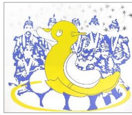
Artist: Stass Shpanin Title: Quack Date: 2017 Size: 58" x 69" Medium: Flashe and Glitter on Canvas Price $4000