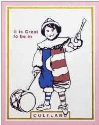
Artist: Stass Shpanin Title: Poster Series - It is Great to Be In Date: 2017 Size: 29" x 23" Medium: Flashe on Canvas Price $1600