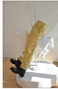
Artist: Stass Shpanin Title: Battlefield Date: 2017 Medium: Mixed media sculpture Price $2500