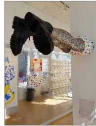
Artist: Stass Shpanin Title: Legs Date: 2017 Medium: Mixed media sculpture Price $2500