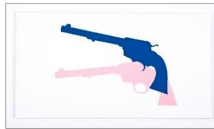
Artist: Stass Shpanin Title: Position #1 Date: 2015 Size: 41" x 75 1/2" Medium: Vinyl Paint, Latex Paint and Flake Paint on Canvas Price $3500