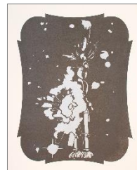
Artist: Stass Shpanin Title: Poster Series - Stars Date: 2017 Size: 29" x 23" Medium: Flashe on Canvas Price $1600