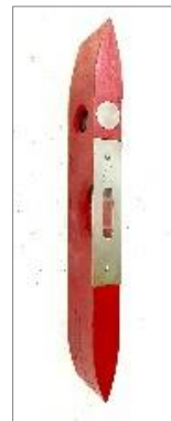
Artist: Peter Kirkiles Title: Torpedo Level Date: 2015 Size: 36 x 3 x 8 medium: cedar, steel, handblown glass, paint Price $3200