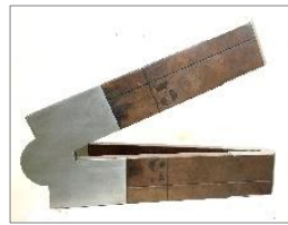
Artist: Peter Kirkiles Title: Horizontal Rule Date: 2015 Size: 36 x 24 x 18 medium: steel, claro walnut, ink Price $4000