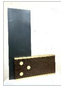
Artist: Peter Kirkiles Title: Square Date: 2015 Size: 30 x 18 x 3 medium: steel, wenge, brass Price $3800