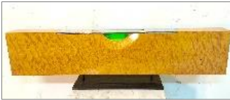
Artist: Peter Kirkiles Title: Birdseye Level Date: 2015 Size: 36 x 10 x 4 medium: birdseye maple, stainless steel, handblown glass, painted steel base Price $4800